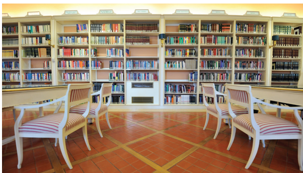
Foreign Legislation Room

It organises periodic bibliographical exhibitions and, in partnership with the other entities involved, arranges visits to the "Insula sapientiae", the complex of buildings making up the Dominican convent of Santa Maria sopra Minerva.