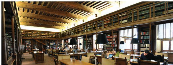
Sala delle Capriate (Truss-roofed Hall)

In 1871, with a collection numbering 22,000 books, the Library was moved to the second floor of Palazzo Montecitorio in Rome, seat of the Chamber of Deputies of the new Kingdom of Italy, where it remained until December 1988, when it was opened to the public and transferred to its present location in Palazzo di Via del Seminario , in the complex of buildings making up the ancient Dominican convent of Santa Maria sopra Minerva.